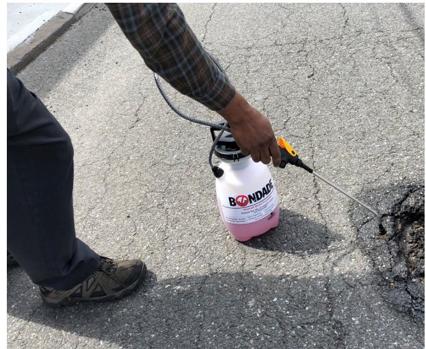
Bondade® is available in 5 and 55 gallon containers. *Call or visit our website to order trial size with sprayer.